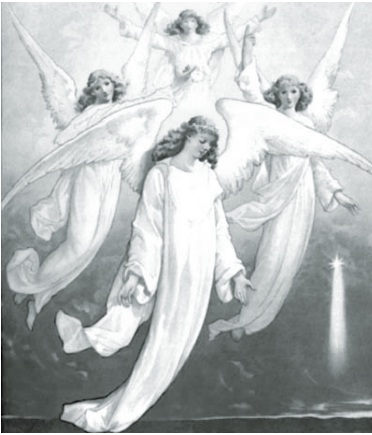
Christmas - Luke 2: 15-20