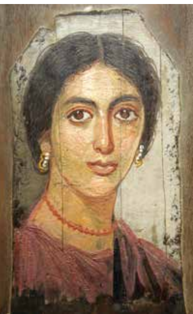
Early icons bear a clear resemblance to second-century Egyptian wax encaustic mummy portraits.

of the issue of blood. 33 Some of the earliest surviving icons, from the sixth century, reflect continuity with traditional images of pagan gods, before which devotees would light candles and burn incense. Other early icons bear a clear resemblance to the wax encaustic mummy portraits from Fayum, Egypt; the Fayum portraits depict an idealized version of the dead person, who was expected to be resurrected. Early Christian icons also appear to continue the Roman tradition of portraiture.