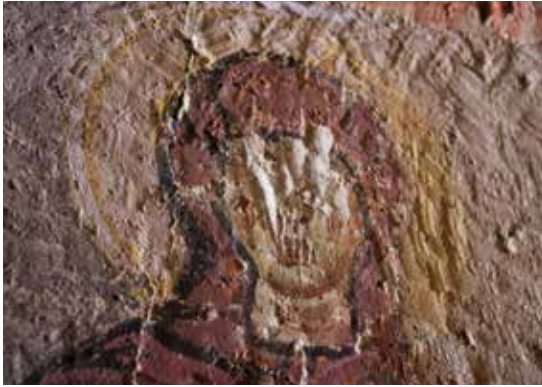
Many icons and other religious images were defaced or destroyed during eighth- and ninth-century waves of iconoclasm.

worship, he makes the primary argument that the incarnation made it permissible to create images of Christ and the saints. He contends that accusations of idolatry are rooted in a fear of matter, which God has made holy. Moreover, as God is Creator, and humans are in the image and likeness of God, so we ought to create images.