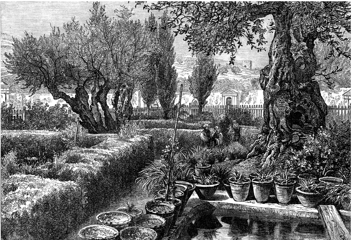
A drawing of the Garden of Gethsemane

The words of Jesus' prayer echo the anguished psalms of lament. The desolation of