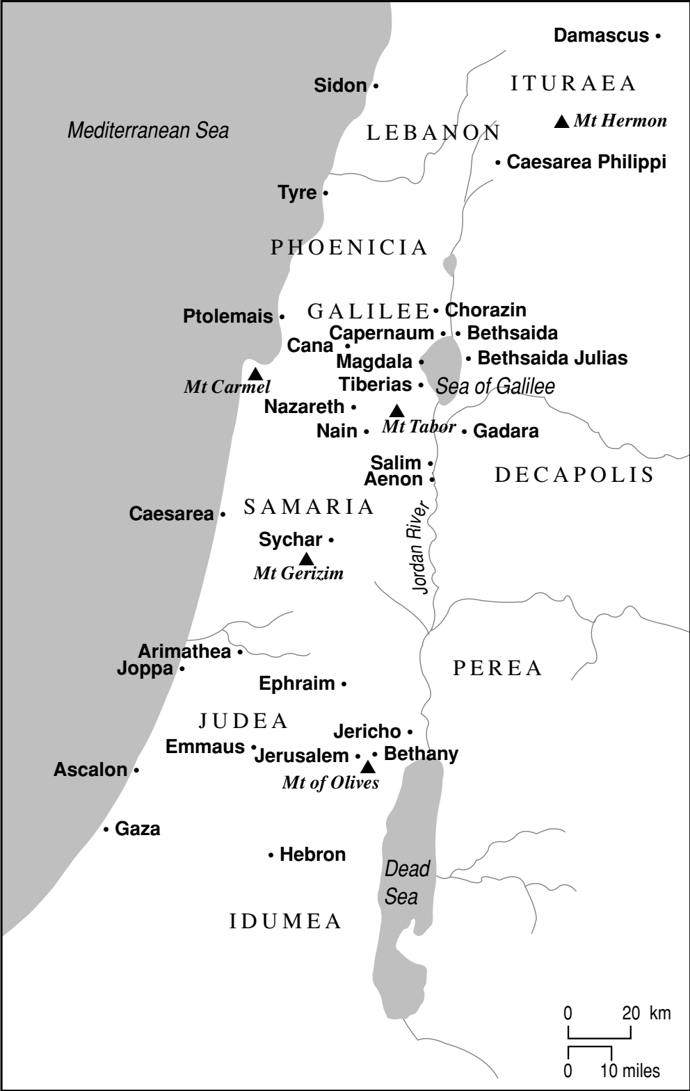
Palestine in the Time of Jesus