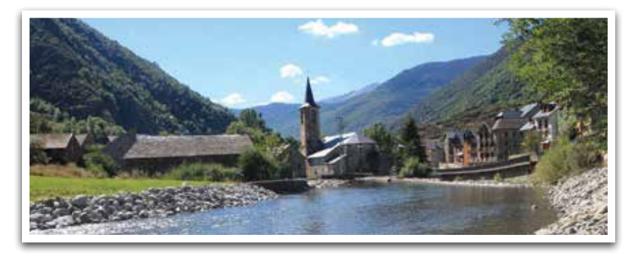
Isil, Pallars Subirà

This whole introduction is my way of telling you that I'd like to spend some time every day in spiritual reflection and prayer. I am not sure how to start and that's why I'm asking for your help. Obviously, I don't want some kind of "How to pray in one hour" short course, just some guidance on getting started, texts that could help me, etc.