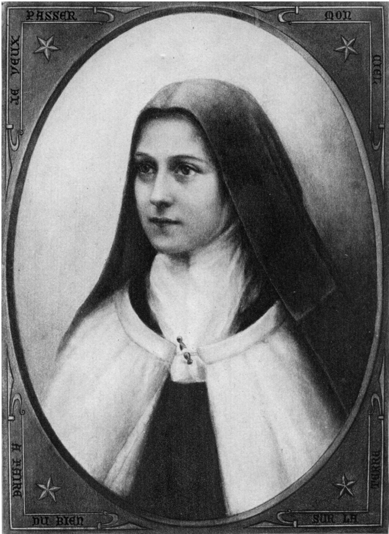
Sister Thérèse of the Child Jesus