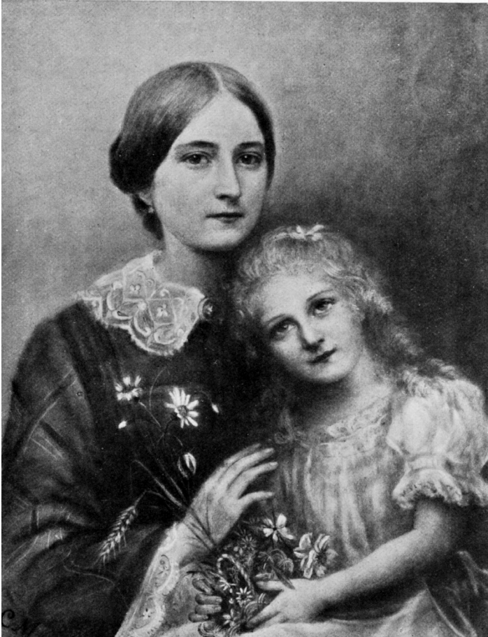
Thérèse as a Child and Her Mother

I remember Mama's smile; Her deep gaze seemed to say, "Eternity delights me and draws me . . . I'm going to go into the blue heavens To see God!"