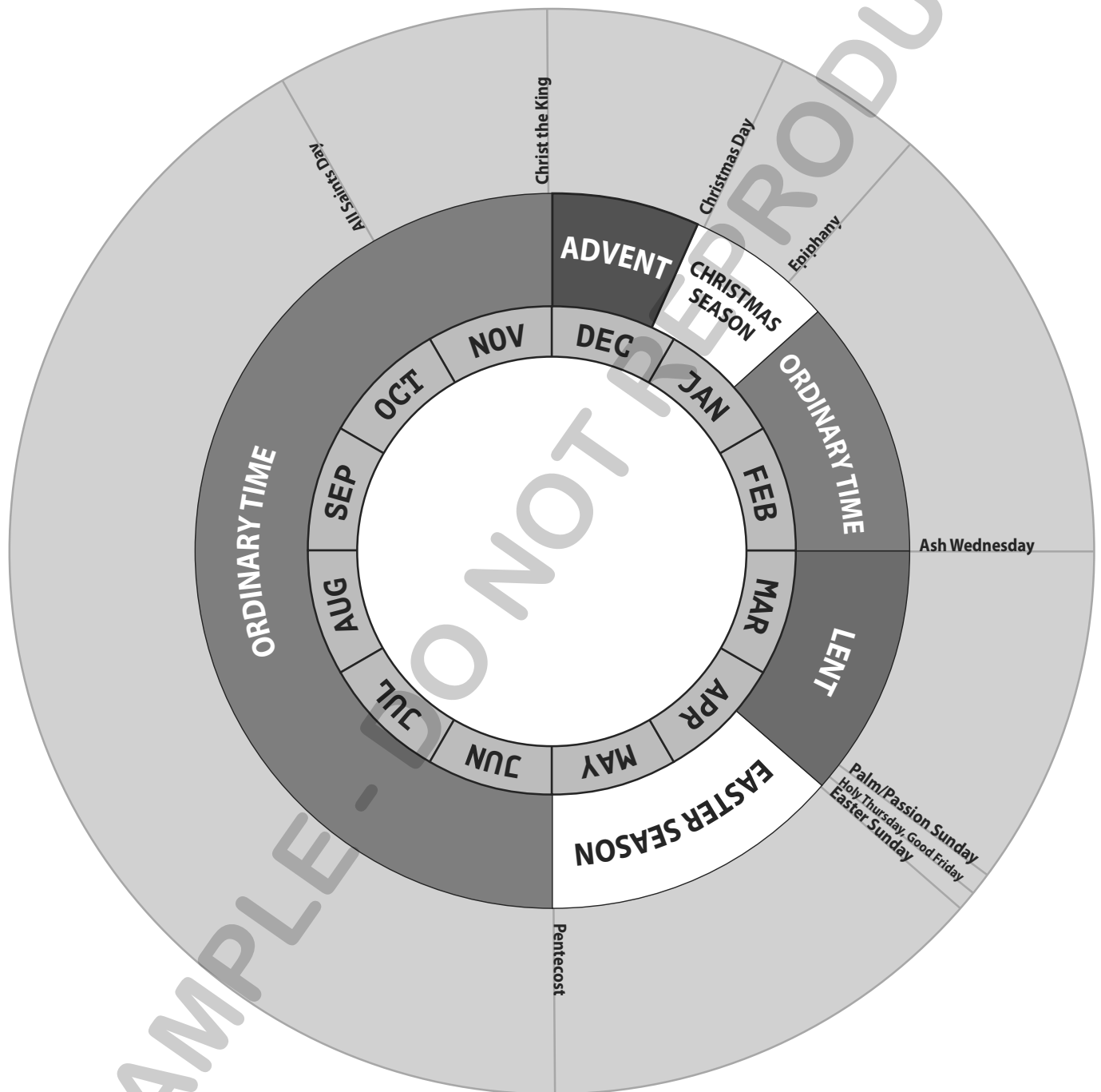
CHART FOR THE CHURCH YEAR