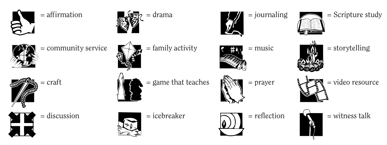
The Format The resources for each Sunday are set up in the following sequence: